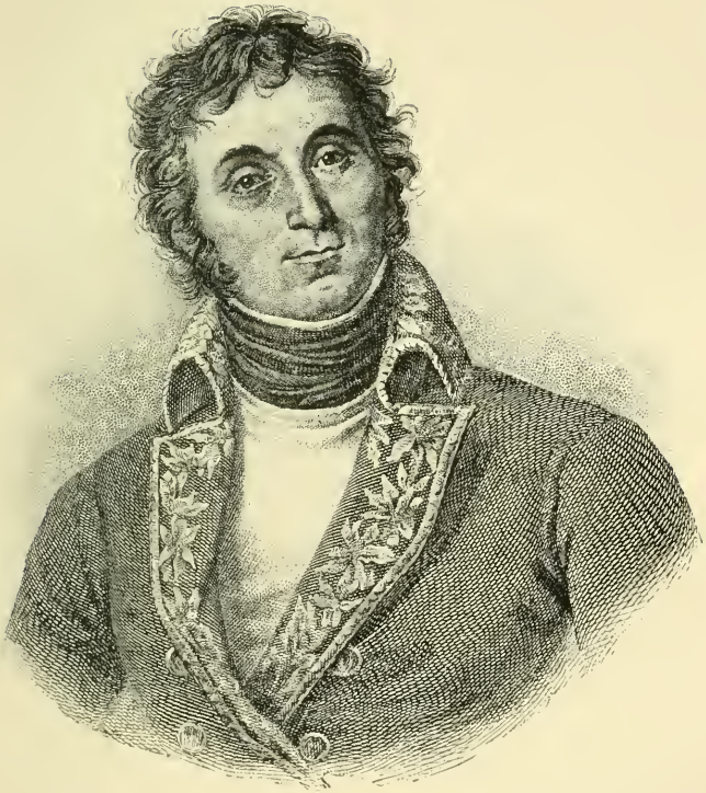
MASSÉNA. ( PRINCE OF ESSLING )